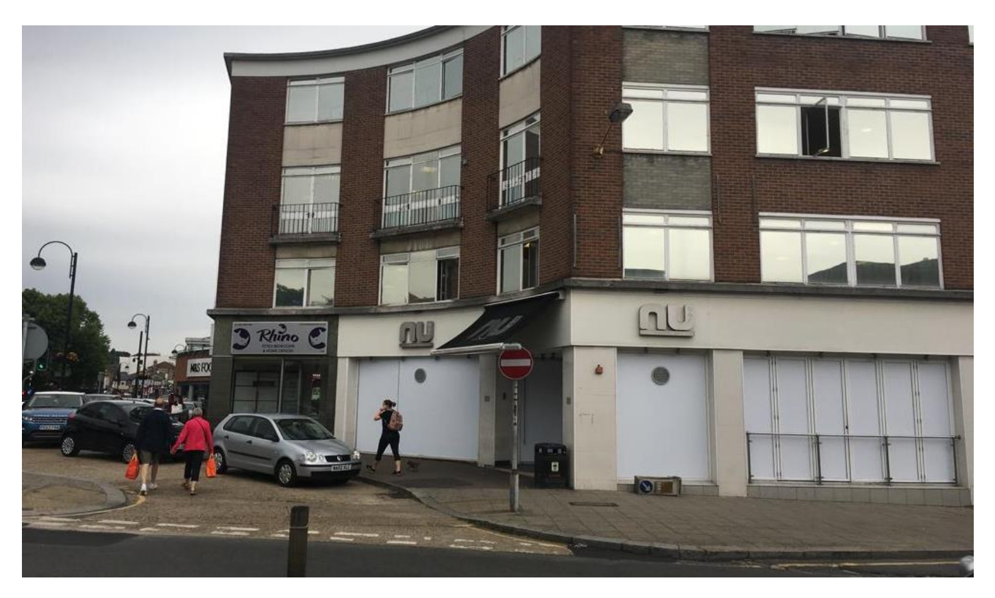
Improvements made by opening Tom Dick and Harry's restaurant in 2018

Nubar boarded up when it was closed for 2 years.