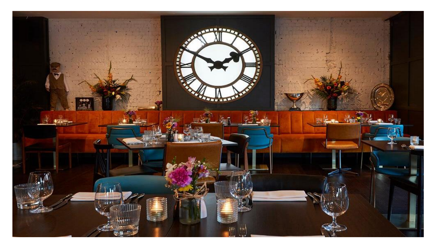
Families enjoying their lunch or dinner in Tom Dick and Harrys

Inside Tom Dick and Harry's restaurant. No dancefloor, no DJ area. Just tables and chairs for 50 people eating.